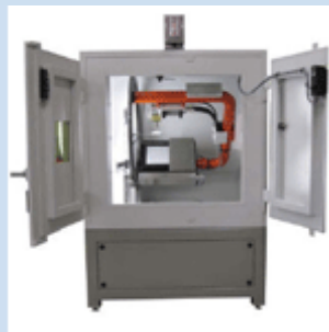
The X-RAD 225Cx system allows targeting of the radiation field through three-dimensional imaging of the subject.

NIH/NCI joins a growing number of international research institutions who have purchased the X-RAD 225Cx, including the Netherlands Cancer Institute, Maastricht University, Dana-Farber Cancer Institute, Duke University and the University of Texas Southwestern Medical Centre.